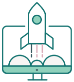
Technology Sales & Services