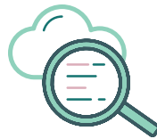
Data & Analytics