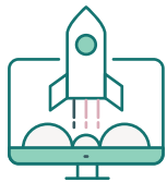
Technology Sales & Services