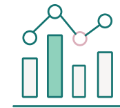
Finance & Accounting