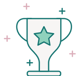
Business Change & Transformation