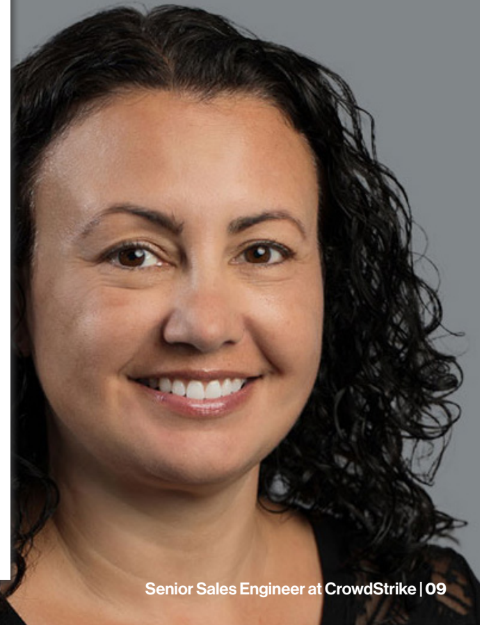
Senior Sales Engineer at CrowdStrike | 09

SENIOR DIRECTOR, DIVERSITY, EQUITY & INCLUSION